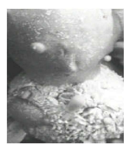
Figure 1. Molten clay ball (top) sticking to high iron ball.

Upon reporting this data, the customer asked if pond fines would be high in clay content. Yes, the culprit was identified independent of fuel analyses. Pond fines being blended in with the coal were creating large amounts of molten glassy particles that were causing excessive slag.