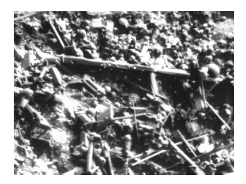
Figure 3. Crystals of CaSO4 bonding flyash together.